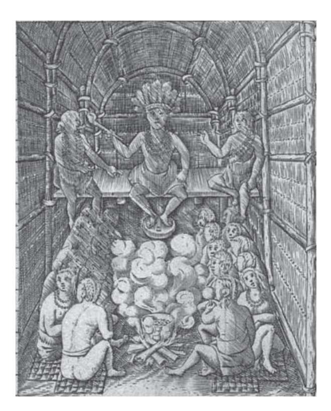
Fig. 2. Detail of longhouse from John Smith's 1612 map of Virginia. ^{\rm 14}

that the forest and the settlement grew up together over time.